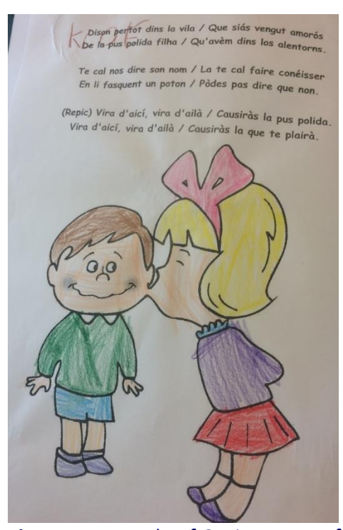
Figure 1: Example of Occitan poem for the early years

and heritage came through very strongly in all the classes that I observed. Children are introduced to Occitan culture through songs, dance, and poetry from an early age and throughout primary school they collect these in a separate folder (See Figure 1).